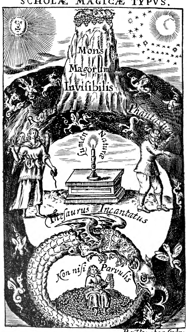
Ro Vaughan sculp: